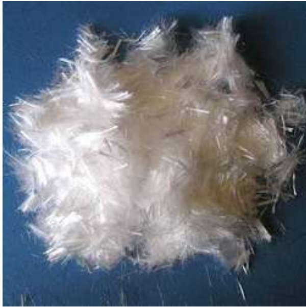
Figure 1: Recron 3s Fibre